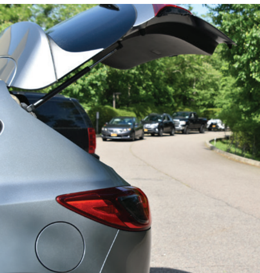
Each week, cars line up in the Museum's driveway to receive food.

Since reopening to the public, the Children's Museum staff have limited attendance to less than 20% of capacity and instituted numerous health and safety protocols that go above and beyond CDC guidelines.