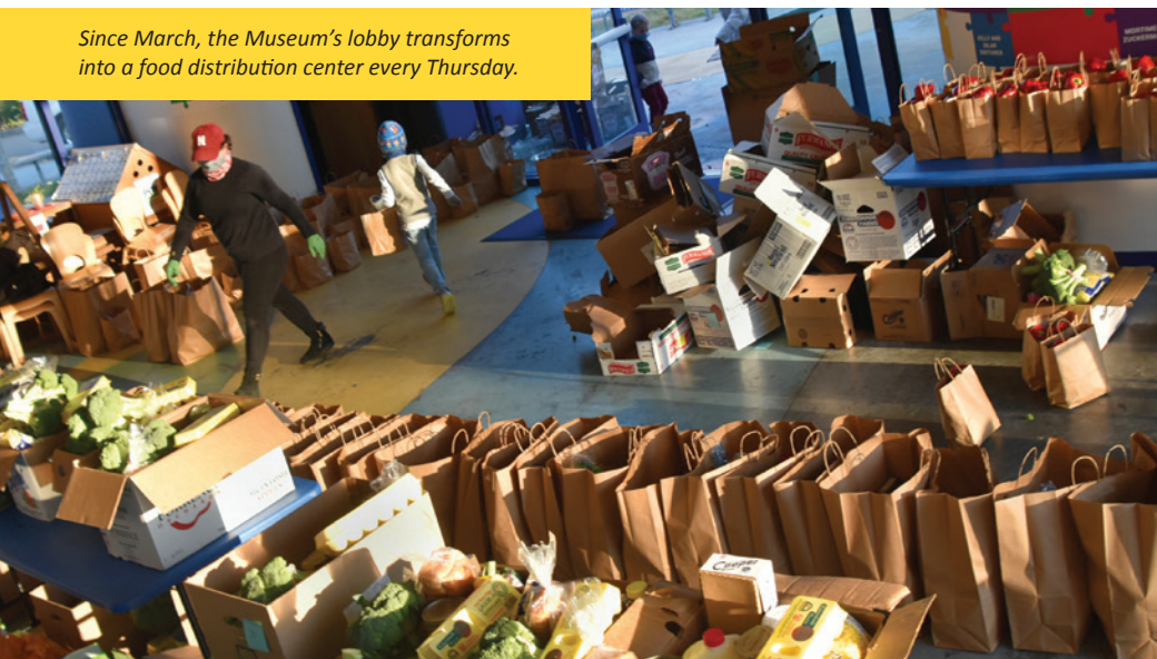
Since March, the Museum's lobby transforms into a food distribution center every Thursday.

CMEE'S COVID-19 RESPONSE: It's not just a food pantry, an online reading program or a safe place to play; it's a social connection that offers families emotional support and hope for the future.