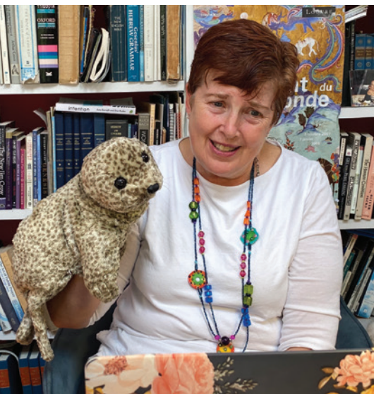
Throughout the lockdown, CMEE educators presented hundreds of virtual education programs.